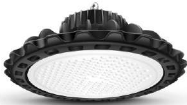
LED UFO High Bay Light